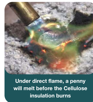
Under direct flame, a penny will melt before the Cellulose insulation burns

Earn points towards NAHB Green Building Program and LEED accreditation as well as builder tax credits by using cellulose insulation