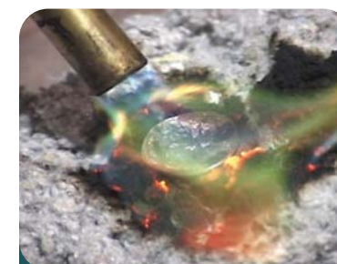
Under direct flame, a penny will melt before the Cellulose insulation burns

Earn points towards NAHB Green Building Program and LEED accreditation as well as builder tax credits by using cellulose insulation